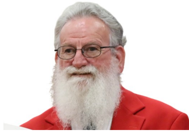
Senior Vice Commandant