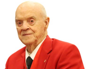
Marine 4 Life Liaison