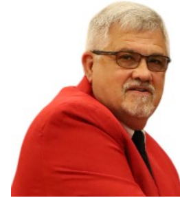
Junior Vice Commandant