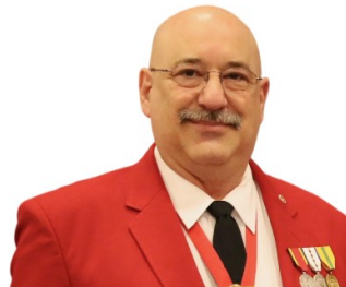
Junior Past Commandant