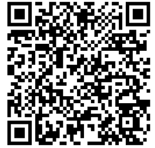
Application QR Code

Every member can make a difference by recruiting new members or helping reinstate members who have fallen into inactive status. The Junior Vice Commandant oversees the Membership Committee and can assist with eligibility requirements and recruiting guidance. Pamphlets are available for members who wish to recruit on their own or take part in organized recruiting efforts.